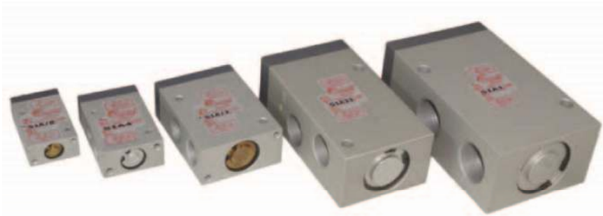
The five sizes in pneumatic version. In the front page the same in solenoid version.

temperature down to -40^{\circ}\text{C} and for high temperature up to +150^{\circ}\text{C} , the version "copper free", the versions NPT threaded) offer valid and reliable solutions on applications of control of the pneumatic piloting of actuators and valves for fluids. Furthermore, the Company realizes