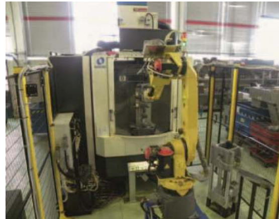
High automation and automatic control distinguish the production unit of Bonesi Pneumatik.

the needs of the OEM, FRL units and the most requested circuit accessories. Among the above products arise the following crowning achievements: a complete range of Pneumo-hydraulics Control Units, tested for several years through applications all over the world and validated by patents deposited in the seventies years; a series of CNOMO cylinders, among the first to be developed in Italy.