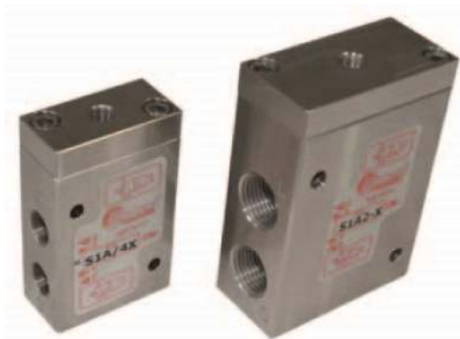
Version with the body in stainless steel.

The Company offers a wide range of manual valves, mechanical, pneumatic and solenoid operated whether for mounting in line or on basis, several series of cylinders to satisfy