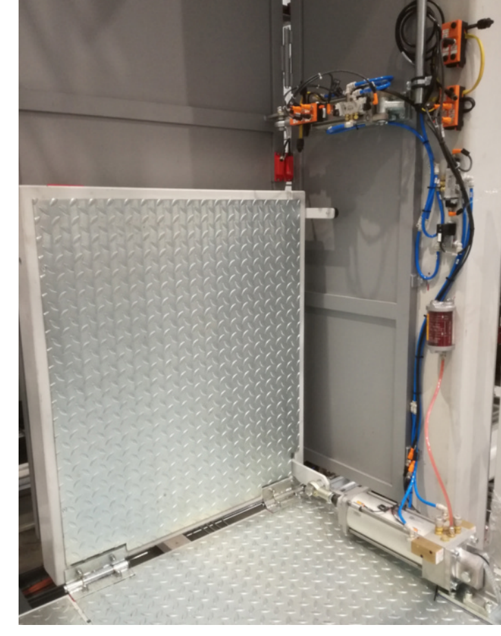
Application for rising platform.

Bonesi Pneumatik is a historical company in the field of the components for Pneumatic Automation and its catalogue includes, moreover the pneumohydraulic control units above mentioned, a wide range of manual, mechanical and solenoid operated valves, for assembling in line or sub bases, several series of cylinders to satisfy all the requirements of the manufacturers of machines, F.R.L. units, the most requested circuit accessories and already since years, with competence and dedication, constantly improves its activity on special product also in presence of limited quantities. In 2017 has obtained from Bureau Veritas the certification ISO 2001:2015.