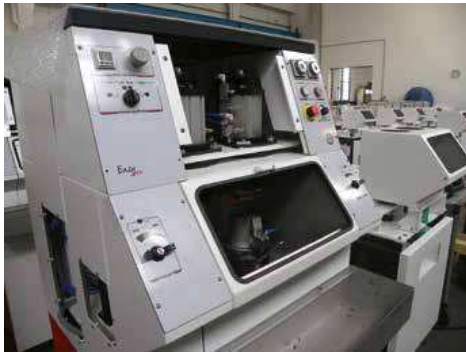
The sanding and polishing system Easy RX in the Comes working area.