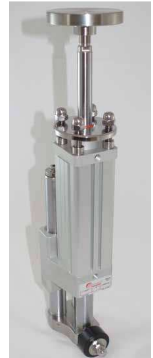
Special pneumatic actuator of Bonesi Pneumatik.

The complete and performing monoblock machines for beer bottles are the best solution for rinsing, filling and crowning operations in microbreweries.